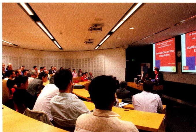
SAAN: First Swiss Alumni Meeting at the University of Sydney