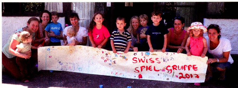
Swiss Playgroup of Sydney kids getting ready for fun in 2012