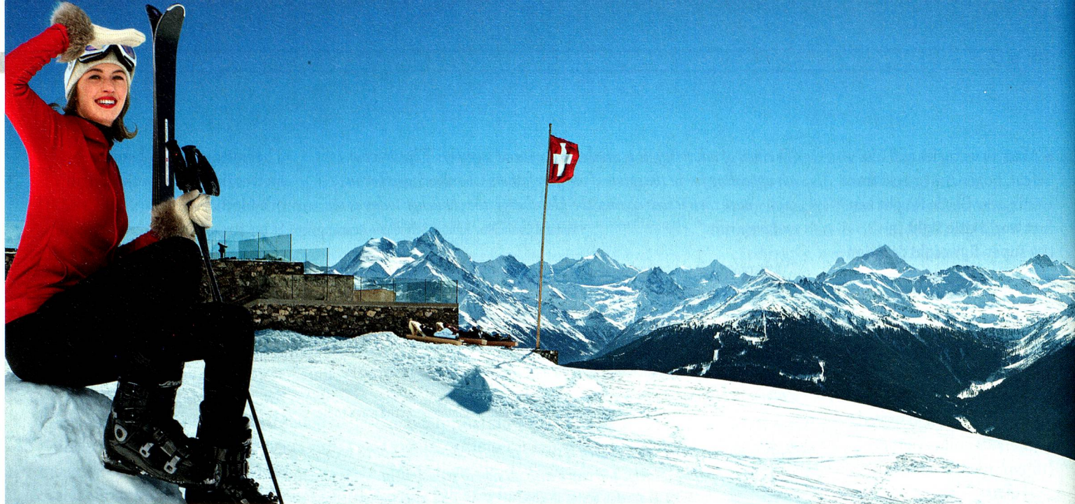
Chetzeron, Crans-Montana, Valais