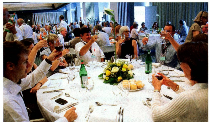
Enjoying good company over lunch on Saturday