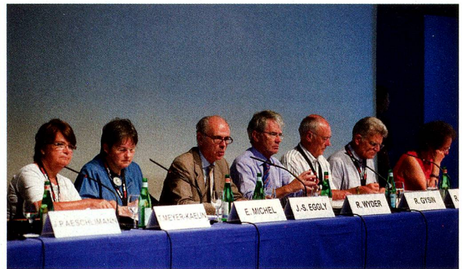
The OSA executive board at the meeting of the Council of the Swiss Abroad