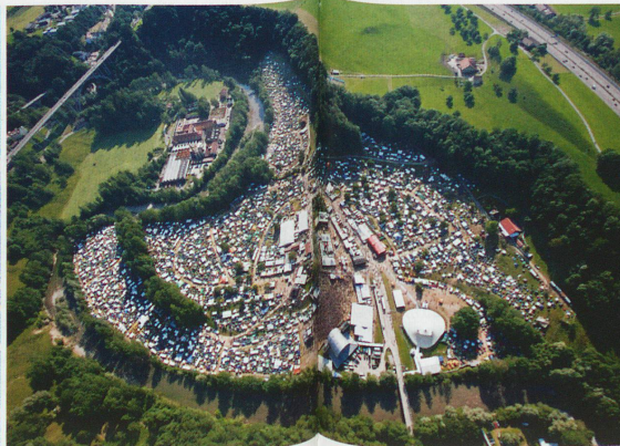
Sittertobel, OpenAir St. Gallen