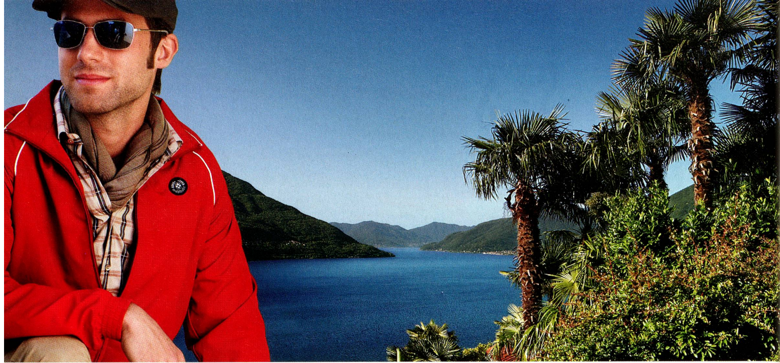
Ronco s. Ascona, Ticino