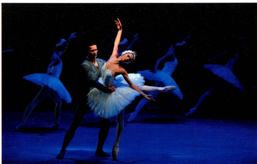
A perennial favourite in the repertoire – Swan Lake by Tchaikovsky dusted off and danced to perfection