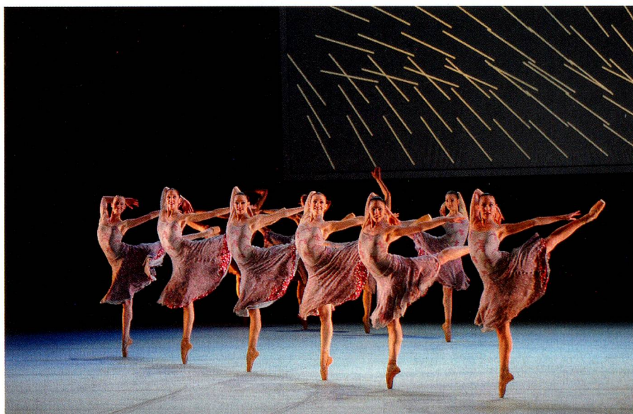
In 2009, Spoerli created the ballet "Wäre heute morgen und gestern jetzt" to the music of Bach