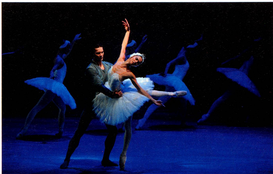
A perennial favourite in the repertoire – Swan Lake by Tchaikovsky dusted off and danced to perfection

Heinz Spoerli's artistic work is characterised not just by his style and sense of aesthetics, but also by his creative ability to keep on renewing himself as an artist. The older he gets, the more relaxed and radical his approach to dance becomes. This will not change after he steps down as Director of Ballet in Zurich. He will continue to work at major opera houses as a guest choreographer. There are already offers on the table. Shanghai is also trying to entice him to train talented young dancers. So, Spoerli will not be lost to the international dance scene after the 2011/2012 season, his last in Zurich.