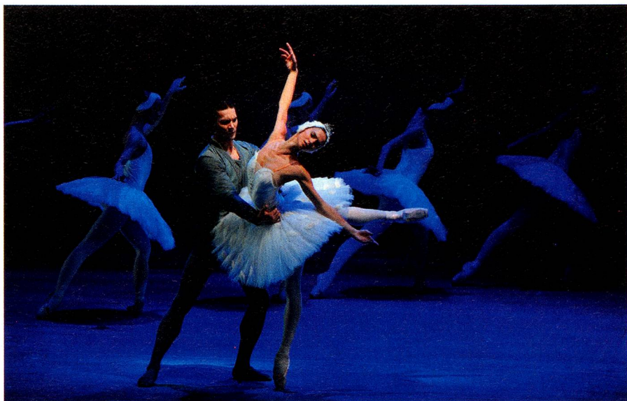
A perennial favourite in the repertoire – Swan Lake by Tchaikovsky dusted off and danced to perfection