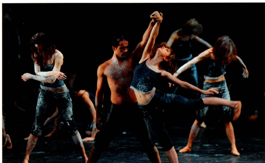
A timeless classic: the Zurich version of Stravinsky's Sacre du Printemps