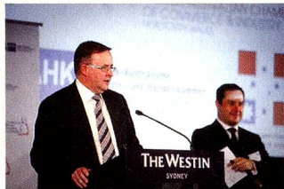
The Hon Anthony Albanese, 31 August, Sydney; attendance: 180