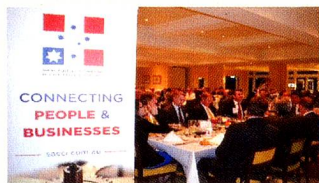
SACCI Swiss Ambassador Cup Dinner, 26 Sept, Melbourne; attendance: 102

The Corporate Luncheon on Sept. 6 with HE Mr Jose Manuel Barroso, President of the European Commission had an attendance of 360.