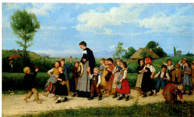
«Der Schulspaziergang». In 1872, Albert Anker, himself a member of the School Supervisory Board, called for mandatory co-educational schooling.