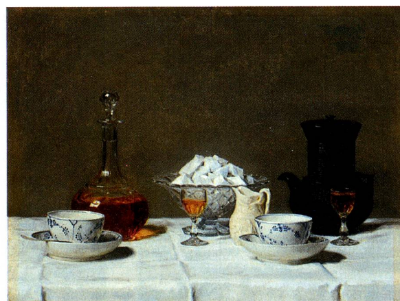
«Tee und Cognac». In his still life paintings, Albert Anker draws inspiration from 200 years ago and the master Jean-Baptiste Siméon Chardin.