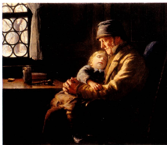
«Grossvater mit schlafender Enkelin». Critics say Anker only painted old people and children. They were the only models who had time to sit for him instead of working the land.