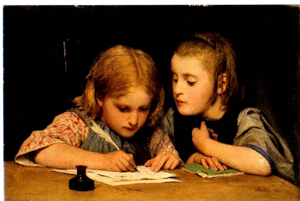
«Schreibunterricht II». Learning to write is not an easy task and certainly no idyll.