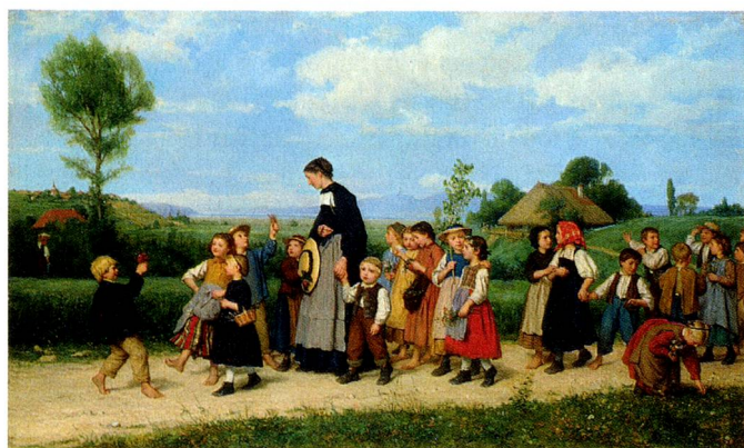
«Der Schulspaziergang». In 1872, Albert Anker, himself a member of the School Supervisory Board, called for mandatory co-educational schooling.