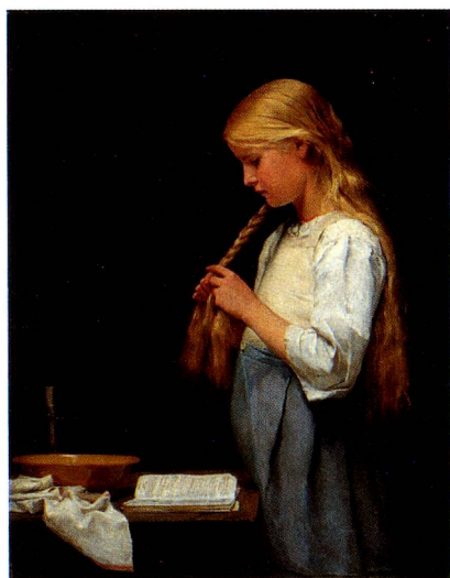
«Mädchen, die Haare flechtend». Anker gives equal attention to the book, cloth and plait: not fastidious realism but an inclination towards the everyday things in life.

This made his success even more significant. Anker was able to exhibit at the much-coveted "Salon", whereas Manet, Degas and Monet were rejected. He lived in Paris in the winter months, he was well versed in topics ranging from Plato to Darwin and he spoke French with his friends. In the summer, he lived and painted in his grandparents' house in Ins, popular and revered. His genre paintings were in keeping with contemporary tastes. In the emerging federal state, Anker-