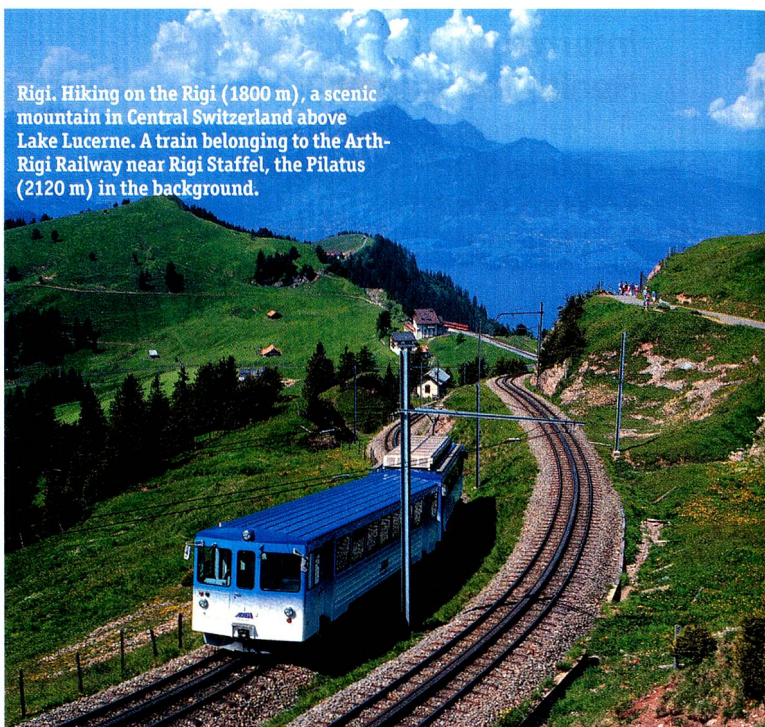
Rigi. Hiking on the Rigi (1800 m), a scenic mountain in Central Switzerland above Lake Lucerne. A train belonging to the Arth-Rigi Railway near Rigi Staffel, the Pilatus (2120 m) in the background.