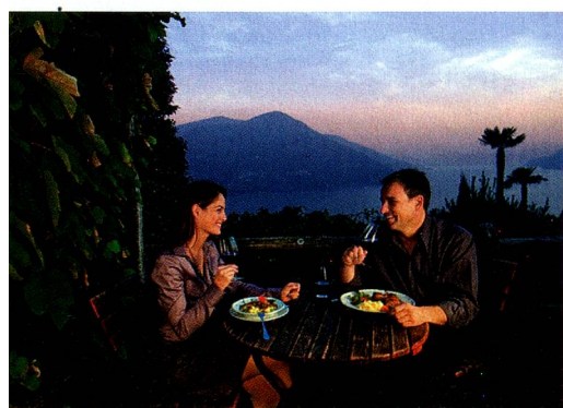
Grotto in the Canton of Ticino

Historical specialty of the Lucerne guilds Lozärner Chügeli-pastete from the 18th century, one of Lucerne's historical specialties, is tradition-