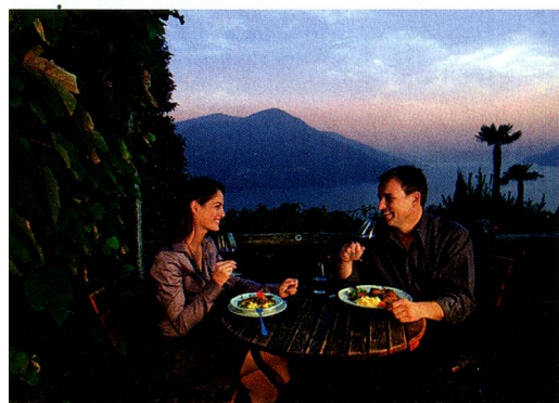
Grotto in the Canton of Ticino

Historical specialty of the Lucerne guilds Lozärner Chügeli-pastete from the 18th century, one of Lucerne's historical specialties, is tradition-