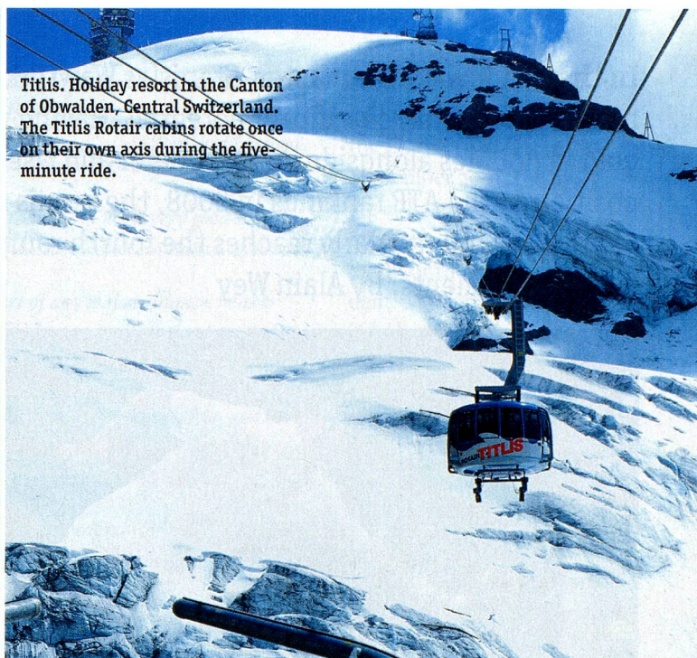
Titlis. Holiday resort in the Canton of Obwalden, Central Switzerland. The Titlis Rotair cabins rotate once on their own axis during the five-minute ride.

park can be reached via the Rotair cable car which rotates 360°. Visitors enjoy a magnificent view of the central Alps at an altitude of 3020 metres. The landscape can be explored on foot along various topical trails (mountain flower trail, the "Tickle Path" and the Kneipp cure trail, etc.). Halfway up to the Titlis is the walkers' paradise of Trübsee, a popular starting point for hikes to a number of mountain lakes.