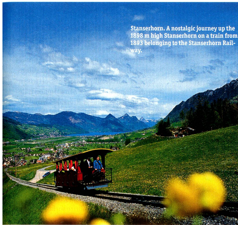
Stanserhorn. A nostalgic journey up the 1898 m high Stanserhorn on a train from 1893 belonging to the Stanserhorn Railway.