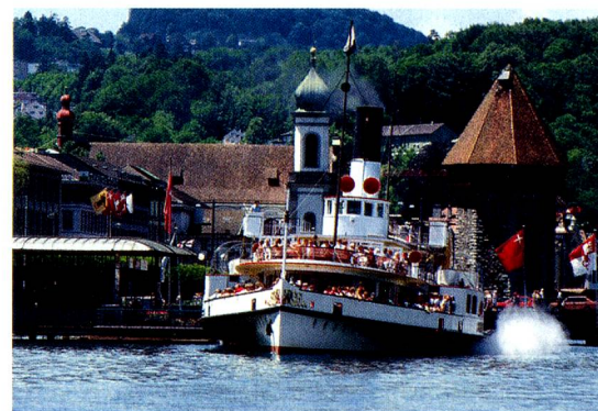
Lucerne. A steamboat from the Lake Lucerne fleet at the dock by the station.

Switzerland Tourism presents a variety of offers for short breaks and longer stays in Switzerland at www.MySwitzerland.com/aso . The top offers include discounts of up to 35% and are available regularly.