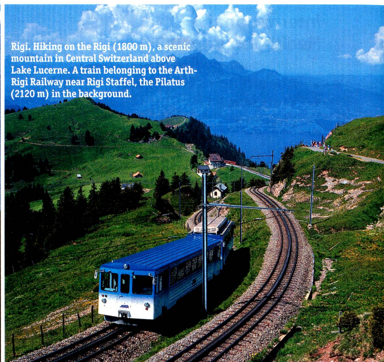
Rigi. Hiking on the Rigi (1800 m), a scenic mountain in Central Switzerland above Lake Lucerne. A train belonging to the Arth-Rigi Railway near Rigi Staffel, the Pilatus (2120 m) in the background.