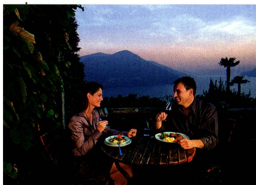
Grotto in the Canton of Ticino

Historical speciality of the Lucerne guilds Lozärner Chügeli-pastete from the 18th century, one of Lucerne's historical specialities, is tradition-