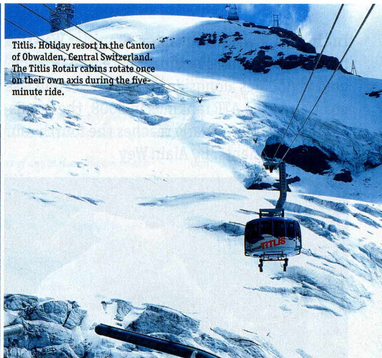
Titlis. Holiday resort in the Canton of Obwalden, Central Switzerland. The Titlis Rotair cabins rotate once on their own axis during the five-minute ride.

park can be reached via the Rotair cable car which rotates 360°. Visitors enjoy a magnificent view of the central Alps at an altitude of 3020 metres. The landscape can be explored on foot along various topical trails (mountain flower trail, the "Tickle Path" and the Kneipp cure trail, etc.). Halfway up to the Titlis is the walkers' paradise of Trübsee, a popular starting point for hikes to a number of mountain lakes.