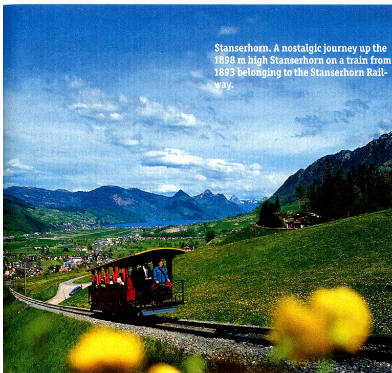
Stanserhorn. A nostalgic journey up the 1898 m high Stanserhorn on a train from 1893 belonging to the Stanserhorn Railway.