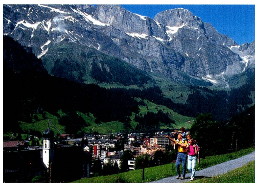
Engelberg (1000 m) in the Canton of Obwalden in Central Switzerland. Benedictine monastery from the 12th century.

park can be reached via the Rotair cable car which rotates 360°. Visitors enjoy a magnificent view of the central Alps at an altitude of 3020 metres. The landscape can be explored on foot along various topical trails (mountain flower trail, the "Tickle Path" and the Kneipp cure trail, etc.). Halfway up to the Titlis is the walkers' paradise of Trübsee, a popular starting point for hikes to a number of mountain lakes.