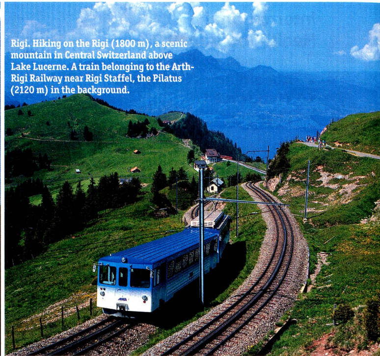
Rigi. Hiking on the Rigi (1800 m), a scenic mountain in Central Switzerland above Lake Lucerne. A train belonging to the Arth-Rigi Railway near Rigi Staffel, the Pilatus (2120 m) in the background.