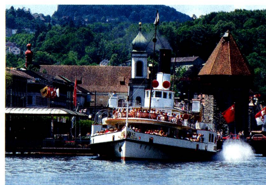
Lucerne. A steamboat from the Lake Lucerne fleet at the dock by the station.

Switzerland Tourism presents a variety of offers for short breaks and longer stays in Switzerland at www.MySwitzerland.com/aso . The top offers include discounts of up to 35% and are available regularly.