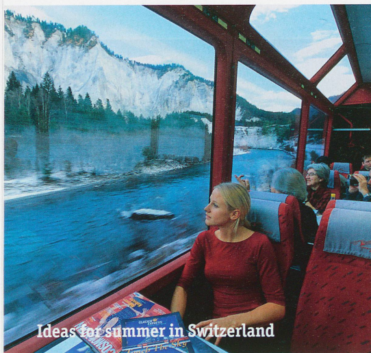
Ideas for summer in Switzerland