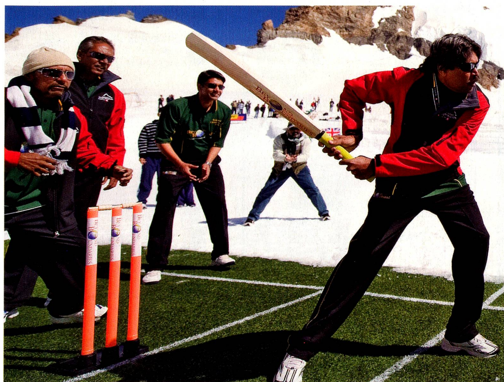
'Slippy wicket' has a new meaning for Indian cricketer and coach Sandeep Patil

Among those taking part were Geoff Howarth, Chris Broad, Alvin Kallicharran, Neal Radford, John Emburey and Collis Llewellyn King.