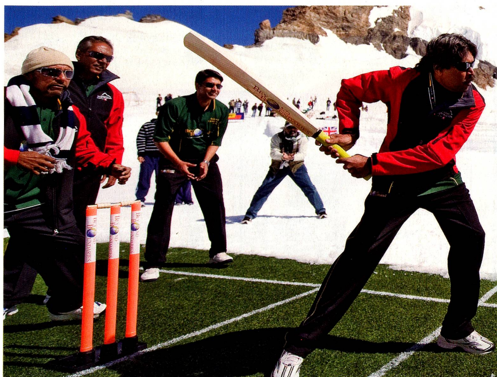
'Slippy wicket' has a new meaning for Indian cricketer and coach Sandeep Patil

Among those taking part were Geoff Howarth, Chris Broad, Alvin Kallicharran, Neal Radford, John Emburey and Collis Llewellyn King.