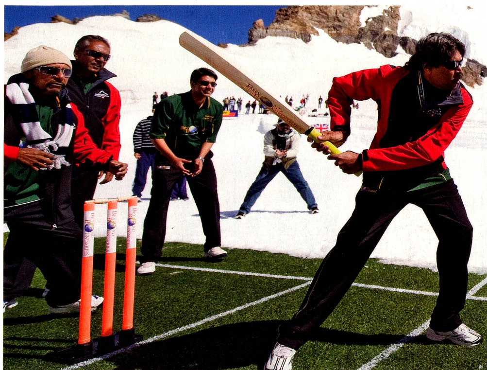
'Slippy wicket' has a new meaning for Indian cricketer and coach Sandeep Patil