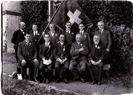
Some of our compatriots around 1914-1918