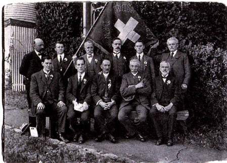
Some of our compatriots around 1914-1918