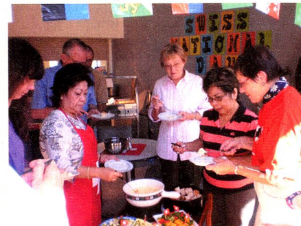
Swiss National Day celebrations in Maryborough