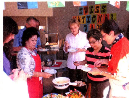
Swiss National Day celebrations in Maryborough