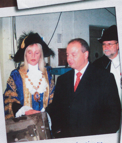
The Lord Mayor with Sir Simon Milton, Deputy Mayor of London in charge of policy and planning