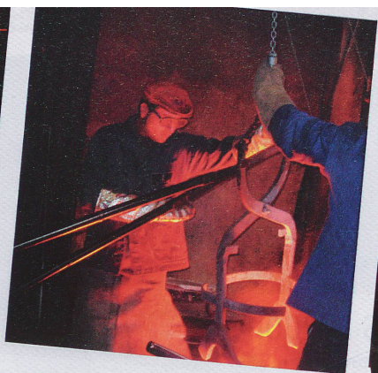
Casting under way in Switzerland's oldest foundry, the Glockengiesserei in Aarau