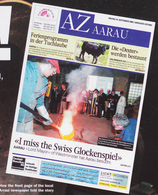
How the front page of the local Aarau newspaper told the story