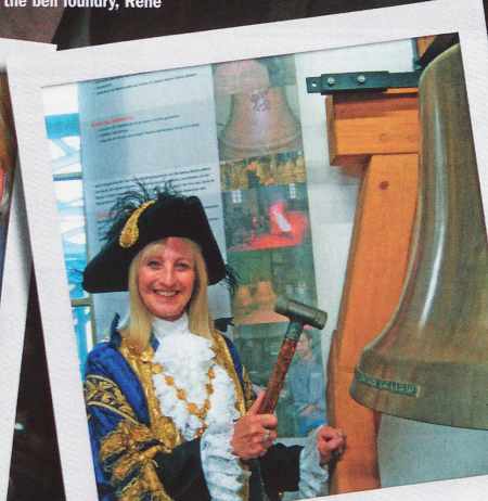
How's this for sound? The Lord Mayor tests one of the refurbished bells