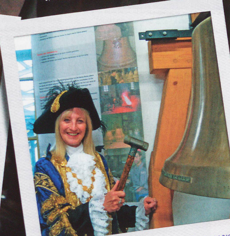
How's this for sound? The Lord Mayor tests one of the refurbished bells