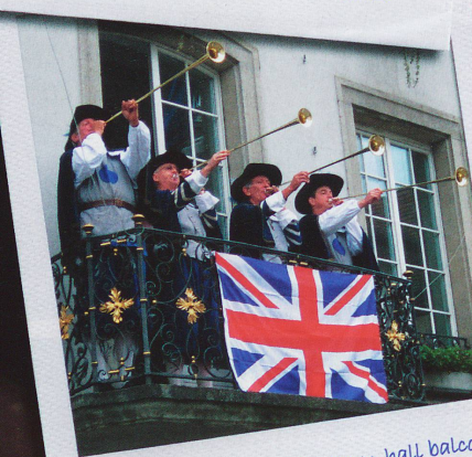
A royal fanfare from the town hall balcony greeting dignitaries from the UK