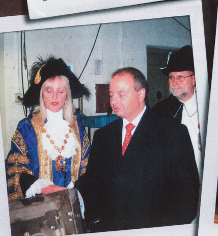
The Lord Mayor with Sir Simon Milton, Deputy Mayor of London in charge of policy and planning