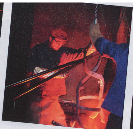
Casting under way in Switzerland's oldest foundry, the Glockengiesserei in Aarau