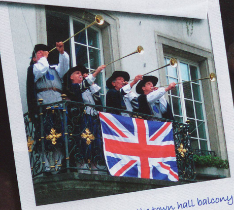
A royal fanfare from the town hall balcony greeting dignitaries from the UK