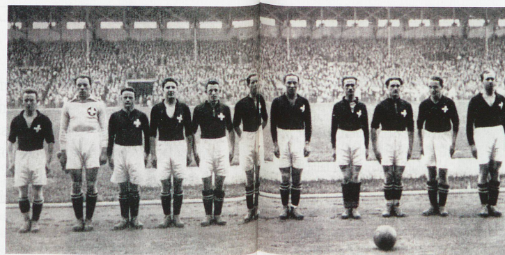
1924 Olympic Games in Paris. The Swiss national team lines up for the national anthem before the start of the match. The Swiss won the Silver medal, becoming European champions

The series of incredible performances by the Swiss amateur team began at the Olympic tournament in Paris in 1924. They returned home as European champions. This tournament, held six years before the first World Cup, is seen as the birth of international football. This is because in Uruguay a tournament featured a South American team for the first time. The Swiss team travelled to Paris by train with a return ticket valid for only 10 days. All the players had worked up until two days before the first match and were back in work two days after the final. Every member of the team had taken unpaid holiday. Success in the six matches caused unimaginable levels of excitement back home. It made football popular overnight in Switzerland. Newspapers dedicated extra pages to a sporting event for the first time and in the corridors of the Federal Parliament they were saying: "The