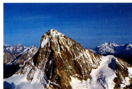
Dent Blanche (Valais), from "Altitude 4000", see P. 7.