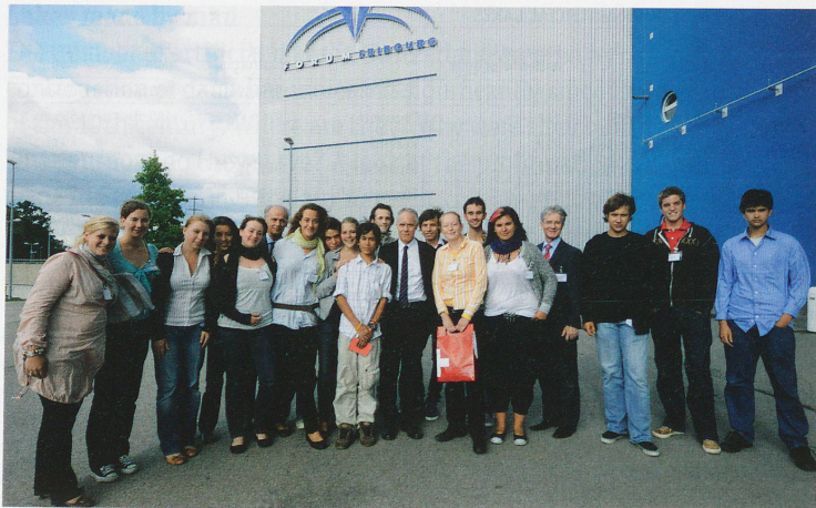
86th Congress of the Swiss Abroad in Fribourg