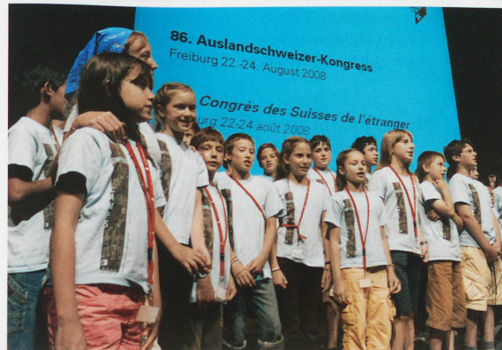
SWISS REVIEW October 2008 / No. 5

The next Congress of the Swiss Abroad will take place in Lucerne from 7 to 9 August 2009.