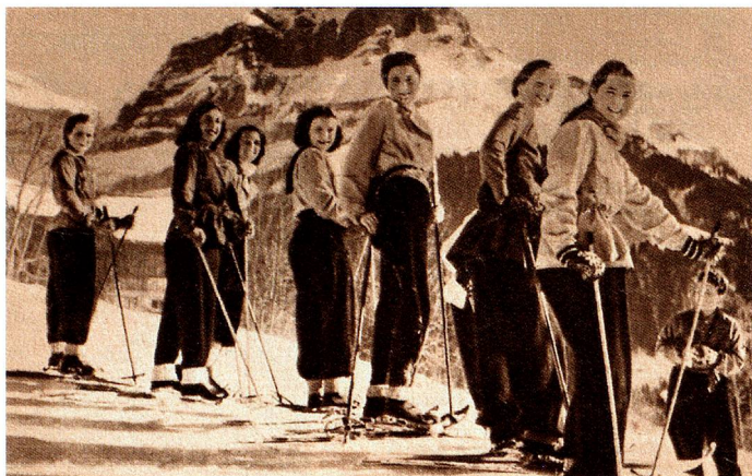
Ski camps, past and present: Engelberg 1942