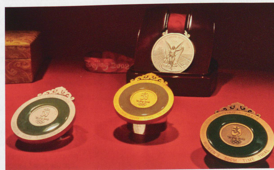
A glimpse of the temporary exhibition on the Olympic Games in Beijing: the Olympic stadium, the pictograms of all the sporting disciplines and the medals inset with jade.