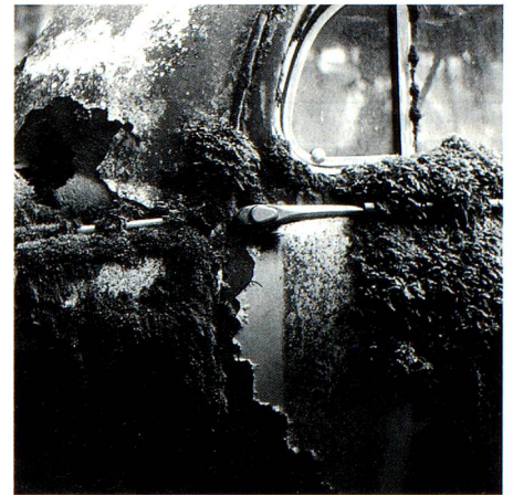
Car cemetery in the Gürbe Valley, Berne (see page 7)