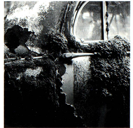
Car cemetery in the Gürbe Valley, Berne (see page 7)