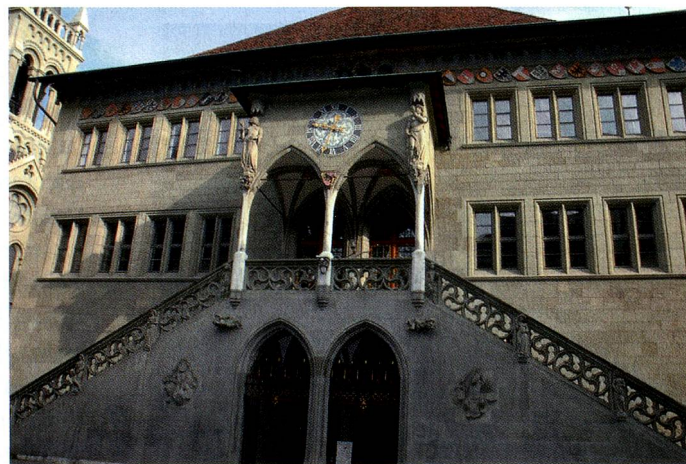
Berne's city hall ...

With the Swiss Club of Northern Nevada, the large family of Swiss associations has gained a new member.