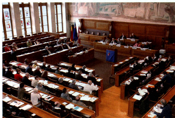
... was the venue for the meeting of the Council of the Swiss Abroad.