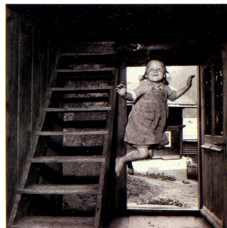
The leap, 1955, photograph by Theo Frey.