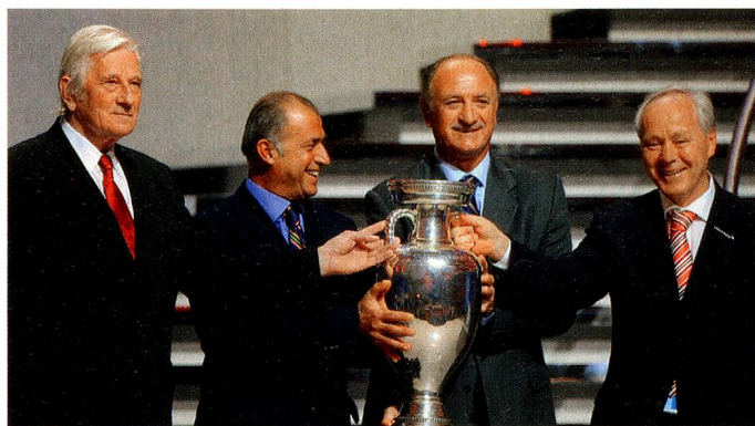
EURO 2008 DRAW: The coach of Switzerland's national soccer team Jakob "Köbi" Kuhn, Portugal's coach Felipe Scolari, Turkey's coach Fatih Terim, and Czech coach Karel Brueckner, from right, hold the trophy during the Euro 2008 final draw in Lucerne, Switzerland, on Sunday 2 December, 2007.

The final countdown has started. The Swiss team now knows who it will face in the