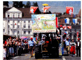
Swiss Yodelers of Sydney in Luzern