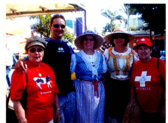
Bundaberg Multicultural Festival