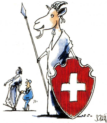
The cartoonist Schaad in "Tages-Anzeiger"

The conservative CVP was able to make gains at the national level for the first time since 1979, adding three seats to the 28 it already had. That means the Christian Democrats and Free Democrats now have the same number of representatives in the large chamber. Nevertheless, the CVP couldn't quite reach its declared target of 15 percent of votes, picking up 14.6 percent. Because it got fewer votes than the FDP, it will have to temporarily shelve its plans to obtain a second seat on the Federal Council. The CVP won an extra-seat in the cantons of Aargau,