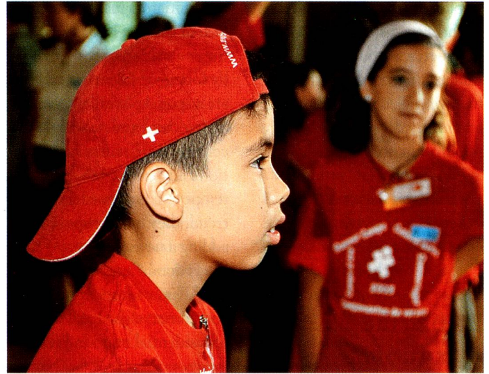
Every year, 400 children from Swiss families resident abroad take advantage of Foundation for Young Swiss Abroad offers and spend their holidays in Switzerland discovering its beauty and unique characteristics. Established in 1917 to help children from war-stricken areas, the foundation has been operating under its present name since 1979.

The 2007 Congress of the Swiss Abroad will have as its theme "United and committed: the Swiss on humanitarian missions". Young people are, of course, more than welcome to attend the Congress. For all those interested in deepening