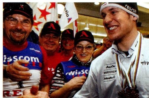
Skiing world champion Daniel Albrecht with fans

The European Commission considers the fiscal practices of some Swiss cantons "incompatible" with the 1972 free trade agreement. The Commission is particularly concerned about the tax advantages offered to foreign companies considering settling in the cantons of Zug and Schwyz. Because of threats