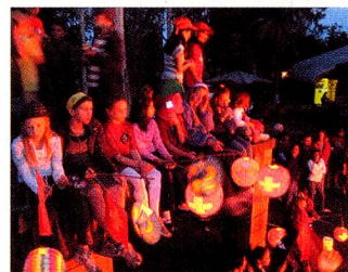
Bonfire at the Swiss National Day Celebration 2007 in Petrie, QLD