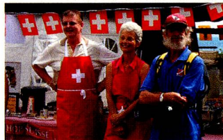
Fraser Coast Cultural Festival 07 (Qld)