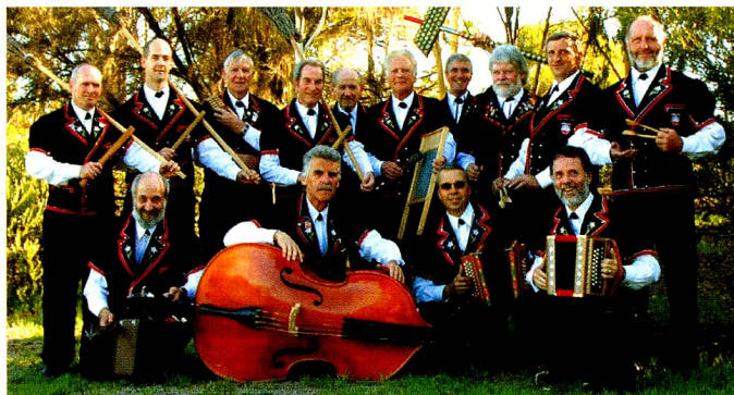
The Swiss Yodel Choir Matterhorn from Melbourne ready for the launch of their CD

Phone: (07) 3899 8996, or email to: mgodat@off-ice.com.au