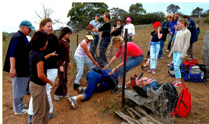
One obstacle to overcome on the bushwalk to Balcombe Hill (Canberra Swiss Club)