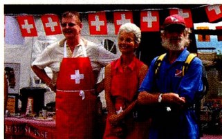
Fraser Coast Cultural Festival 07 (Qld)