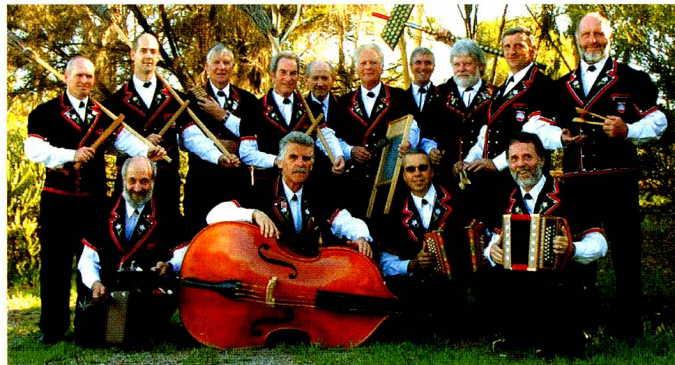
The Swiss Yodel Choir Matterhorn from Melbourne ready for the launch of their CD

Phone: (07) 3899 8996, or email to: mgodat@off-ice.com.au