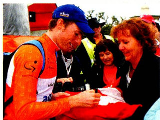
Diehard fans support stage winner Martin Elmiger at the Tour Downunder