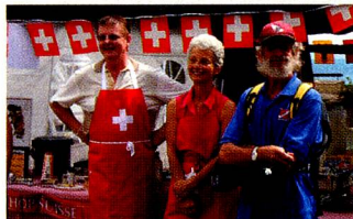
Fraser Coast Cultural Festival 07 (Qld)