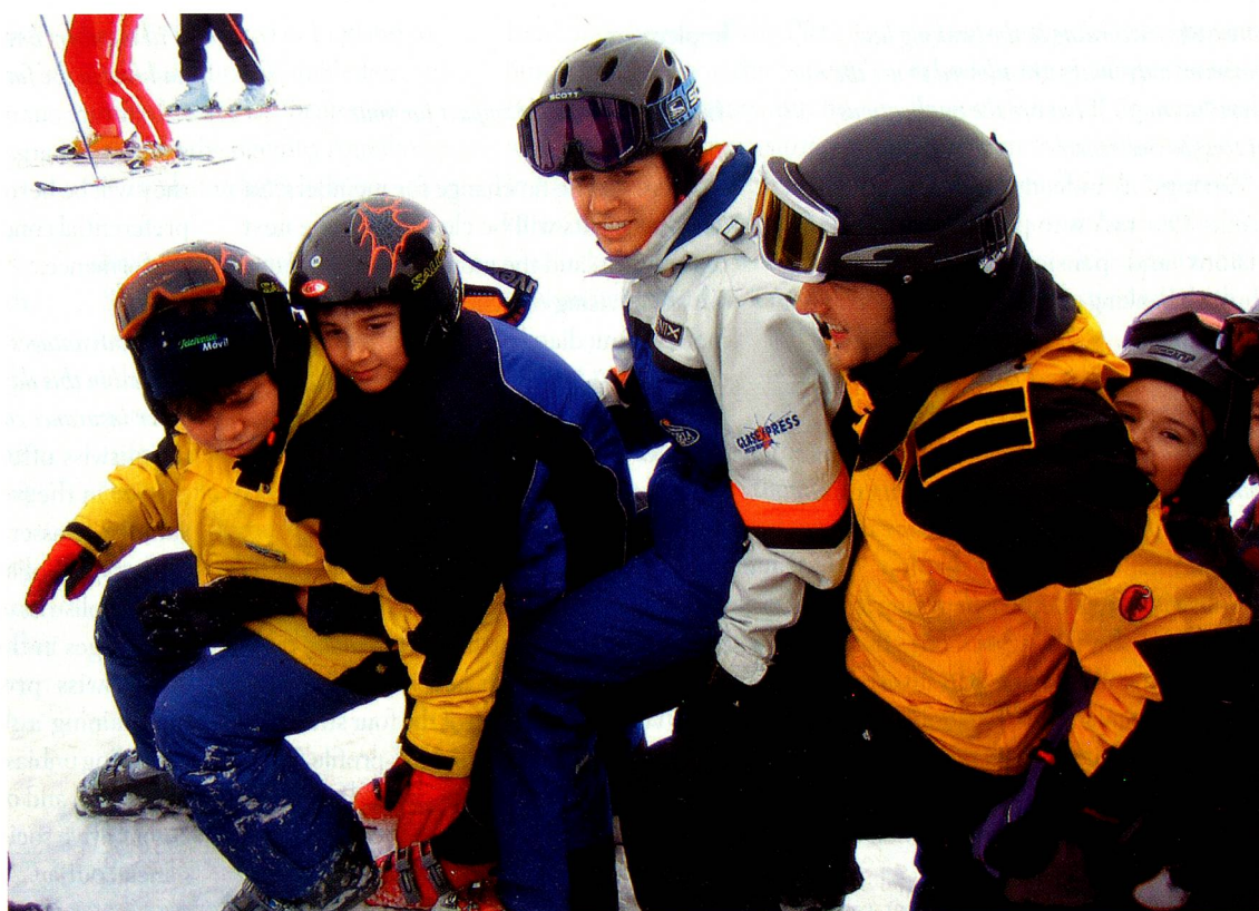
FYSA winter camp in February 2006.

Foundation for Young Swiss Abroad Alpenstrasse 26 CH-3006 Berne Tel.: +41 (0)31 356 6116 Fax: +41 (0)31 356 6101 E-mail: sjas@aso.ch www.aso.ch ("Youth", "Holiday camps for 8- to 14-year-olds", "Program Winter")