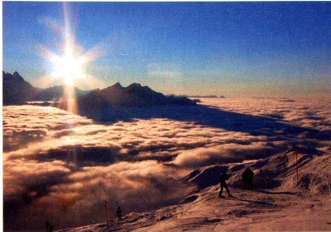
Fantastic weather at the New Year's camp on the Hasliberg

Take an educational holiday Swiss Abroad can learn German or French in two-week language courses. Our workshop will ad-