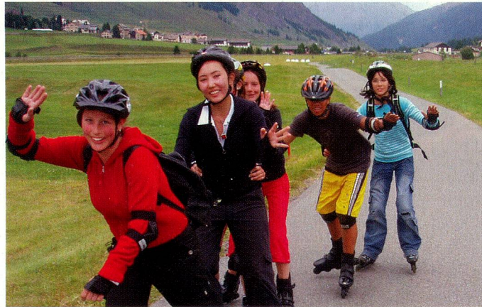
Inline skating in and around La Punt in the Engadine

Some of our loyal customers have been meeting up at this camp for years. Newcomers are cordially welcome. A week packed with all kinds of winter sports activities and the opportunity to meet Swiss Abroad from all over the world.