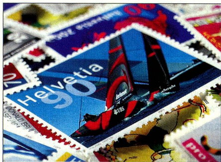
World famous: There was nothing short of a run on the special "Alinghi, Switzerland" stamps. They were already sold out shortly after the date of issue.