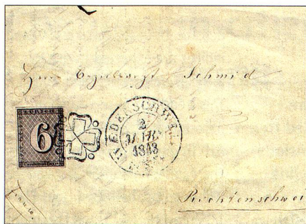
Swiss premiere: The first known letter in Switzerland with a postage stamp on it dates back to 2 April 1843