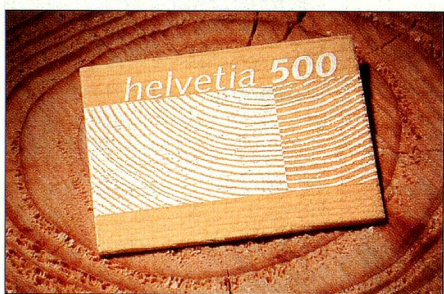
Made of wood: This sustainable, multi-purpose raw material was the focal point for the design and development of this stamp. It reflects not only the unique quality of an individual stamp, but also the pioneering spirit of Swiss Post in general.

www.swisspost.ch www.stamps4fans.com www.swisspost.ch/philanewsletter