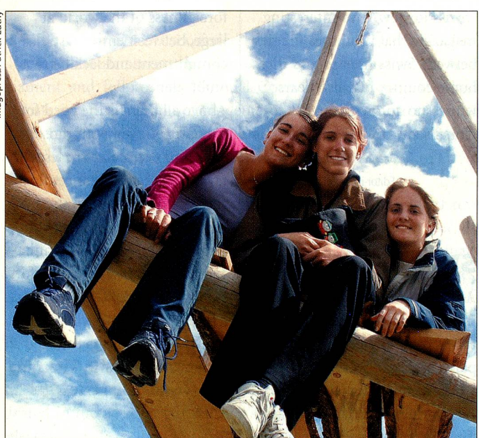
Shared experiences promote a sense of community.

A get-together in the Grisons Alps for 60 young people from over 15 countries. The Sedrun ski region has reliable snowfalls and offers lots of variety. Accommoda-