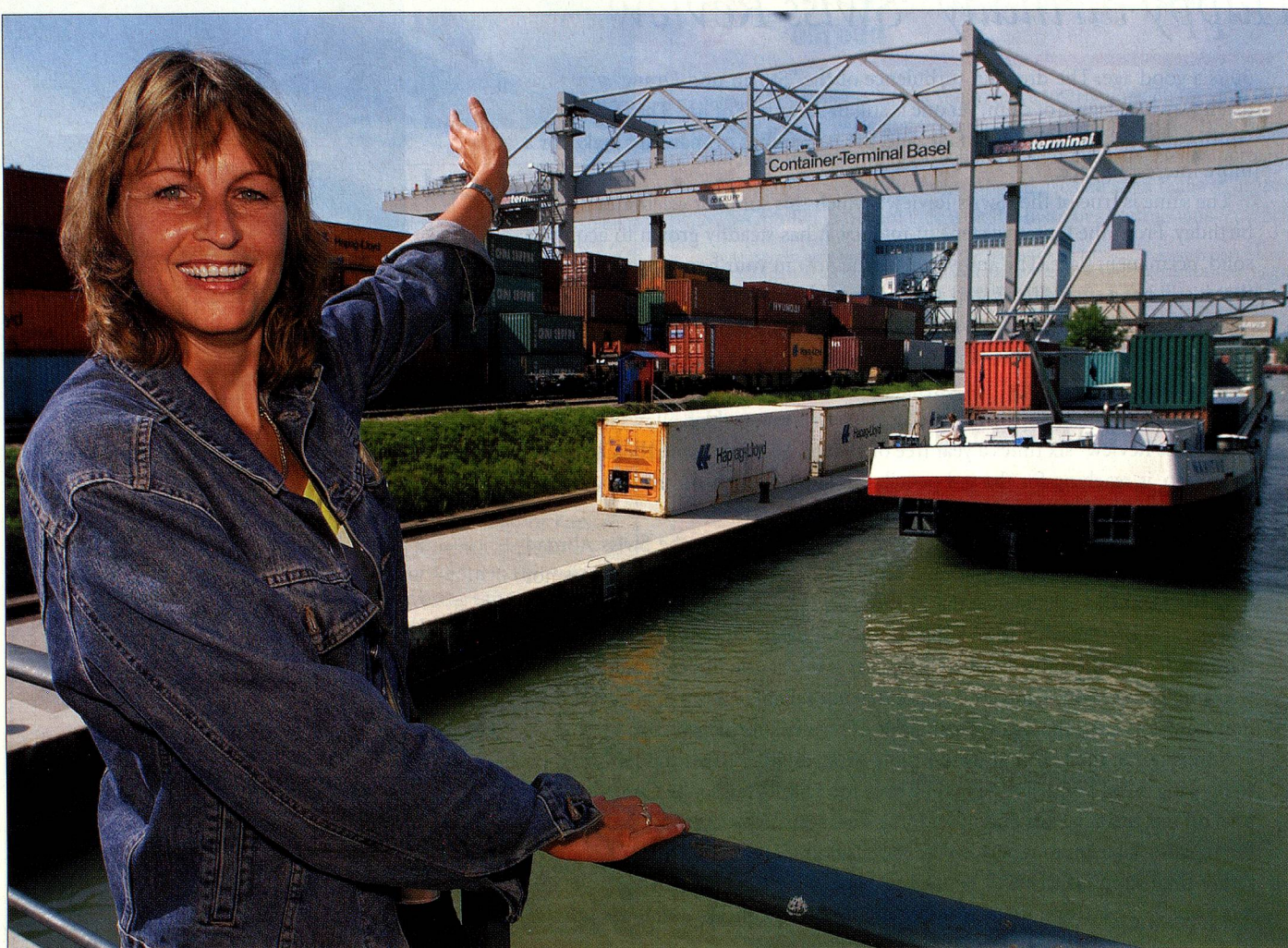
As the household effects leave the Rhine port in Basle, their owner takes a courageous step into the big wide world.