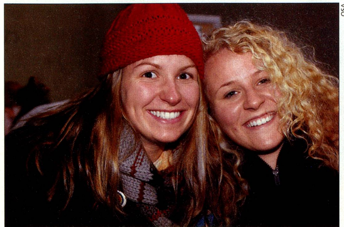
Suddenly, national differences are not an issue.