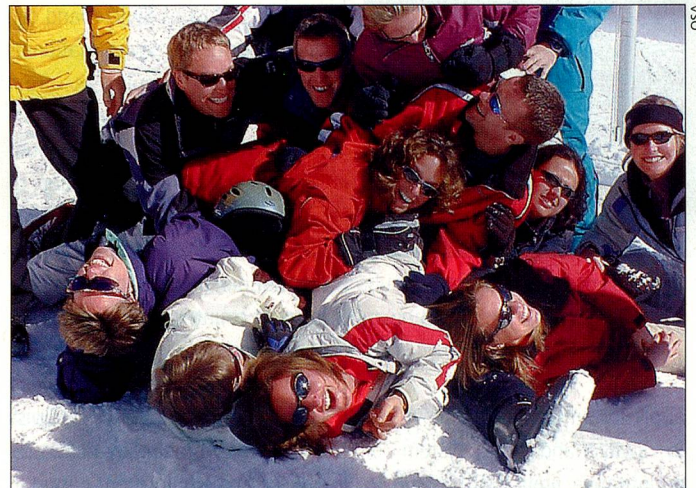
Unforgettable holidays in Switzerland.

There are still some places available for the OSA Easter camp for young Swiss Abroad to be held in the Fiesch valley between 4 and 12 April. Come along and enjoy the springtime snow in the Aletsch region.