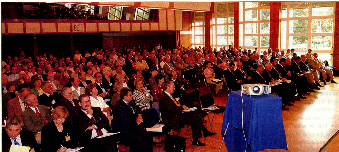
The 81st Congress of the Swiss Abroad in Crans-Montana devoted its discussions to Switzerland's financial sector

The financial sector plays a vital role in our country's economy. This was the topic addressed by the 81st Congress of the Swiss Abroad in Crans-Montana, which was attended by some 400 participants. On the Saturday, high-profile representatives from the world of banking and politics talked about the role and future of Switzerland's financial sector.