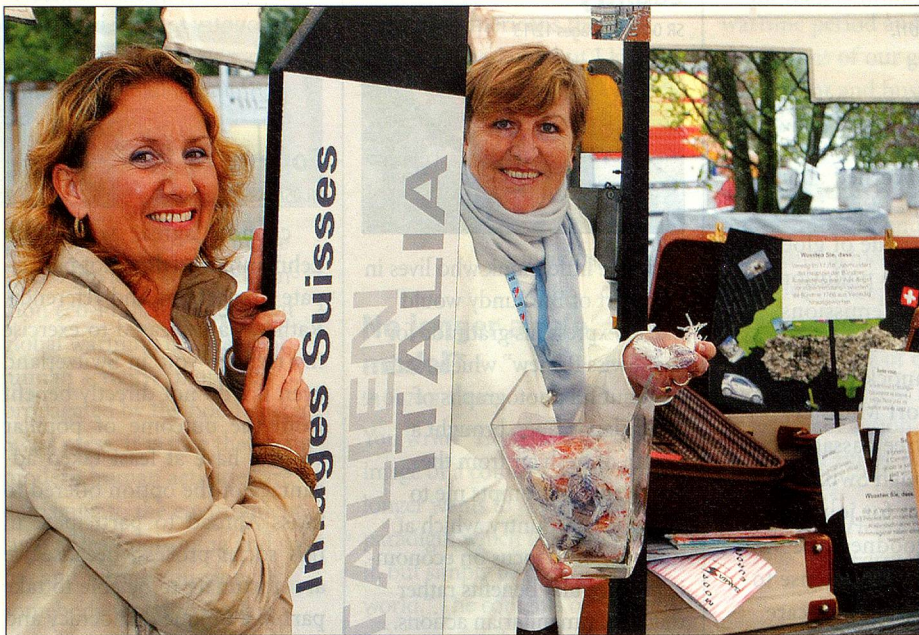
Radiant Swiss Abroad at the "Images Suisses" Italy stand.

On 10 August the Organisation for the Swiss Abroad held its Swiss Abroad day under the motto "Images Suisses" as part of the Expo.02 National Exhibition. Over 14,000 visitors took the opportunity to find out about the Fifth Switzerland. Statistically, one in two Swiss visited Expo.02. In