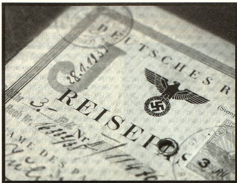
The Swiss authorities ordered the passports of German Jews to be stamped with a "J".

measures: the aliens and refugee policy during the Second World War was "a stark contrast with the image of Switzerland as a humanitarian and open country." Here Professor Bergier did not mince words: "Where its refugee policy was concerned, neutral Switzerland (...) violated fundamental humanitarian principles." The final report of the commission of historians cites the authorities' marking of Jewish passports with a "J" and the closing of our borders in 1942, when our country was for many people the only hope of flight and rescue. At the same time Bergier points to the courageous rescue attempts made by Police Chief Paul Grüninger in St. Gallen and the diplomat Carl Lutz in Budapest, and mentions the major humanitarian aid provided by private relief agencies.