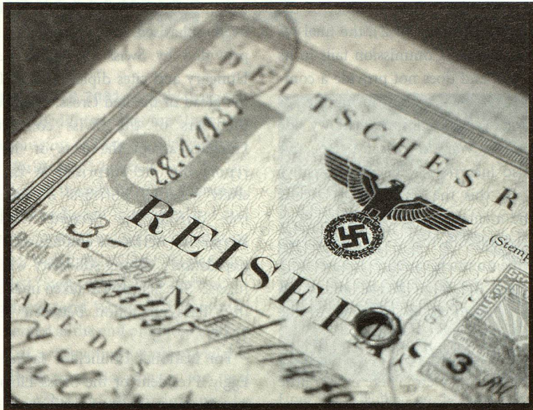
The Swiss authorities ordered the passports of German Jews to be stamped with a "J".