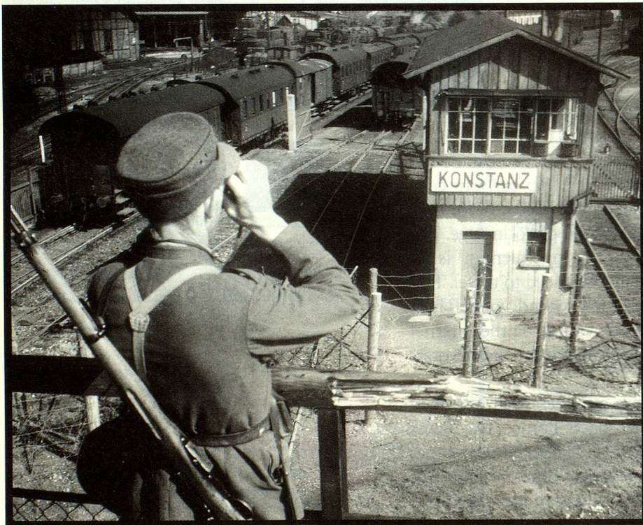
Swiss soldier at the Kreuzlingen border post in April 1945.

In one specific area the Federal Council did not hesitate to introduce Draconian