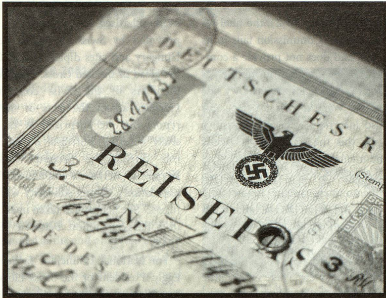
The Swiss authorities ordered the passports of German Jews to be stamped with a "J".