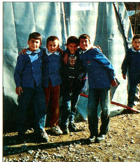
Swiss Solidarity provided 26,000 children with temporary classrooms after the earthquake in Turkey.

way of informing you once or twice a year about how the donations were spent.