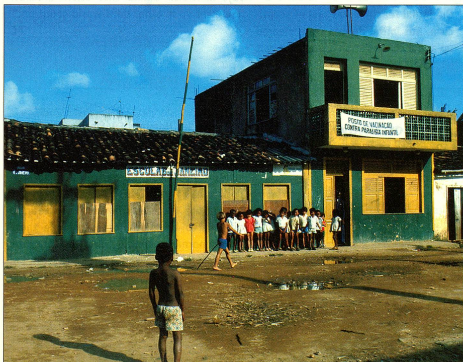
Poverty has many faces. Slum near Sao Paulo.