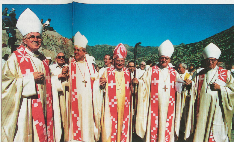
The Catholic church is to be allowed in future to make its own decisions on establishing dioceses.