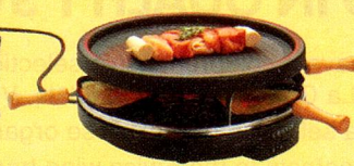
TTM Cervin 4/6-person grill

The SwissFood Company have 3 sizes and styles of Grill to choose from, all made in Switzerland to their high quality standards. All grills come with grill pans, spatulas and a 1-year guarantee. We will also supply 250gms of Swiss Raclette cheese FREE when you order a grill.