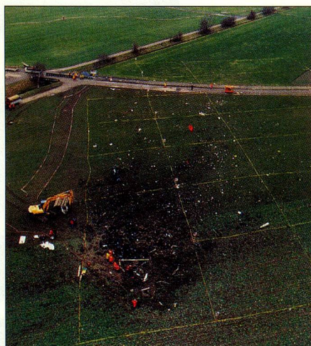
The Crossair Saab 340 crashed near Niederhasli (ZH) shortly after takeoff.

A SAAB PASSENGER PLANE crashed in Niederhasli near Kloten. The Crossair Cityliner plunged into a field shortly after take-off and caught fire, killing all ten on board. The three crew members (including the Moldavian captain and Slovakian co-pilot) and seven passengers were on their way to Dresden. The cause of the crash is still being investigated. This was the first crash in the 21-year history of SAir subsidiary Crossair.