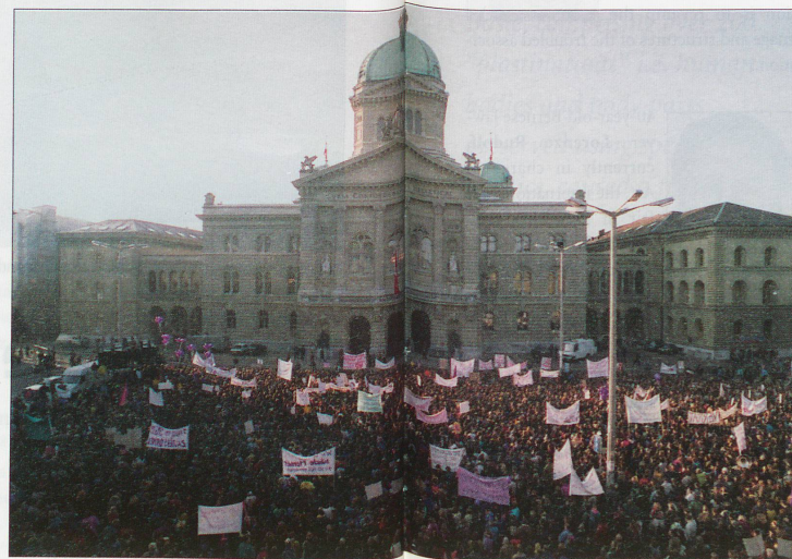
The non-election of Christiane Brunner in 1993 was a bitter disappointment for the women's rights movement.

Thirdly and lastly, the judicial reforms are aimed at relieving the current workload of the Federal Court in Lausanne and the federal court of insurance in Lucerne. The extent of the workload is such that judges risk being unable to evaluate individual cases with the requisite attention to detail, or that trials take up so much time that legal protection can no longer be guaranteed. Rather than impeding access to the Federal Court, parliament has proposed a provision whereby disputes at all levels must first be evaluated by a legal body before they are