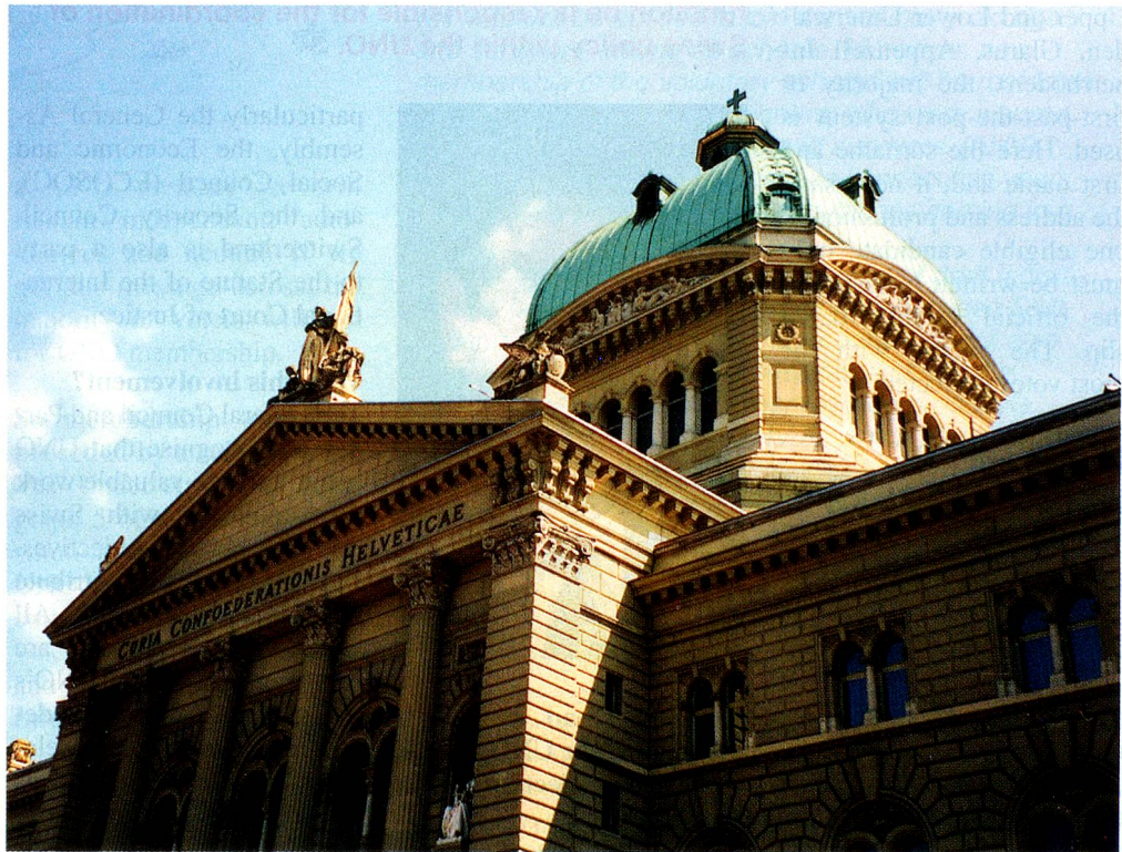
The Houses of Parliament in Berne.

Voters are given a number of ballot slips in the form