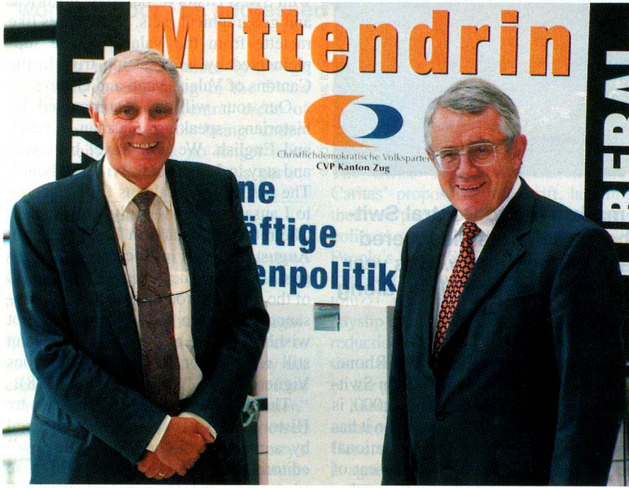
Retiring Federal Councillors Cotti (l) and Koller (r).

Both were elected twelve years ago. Now CVP Federal Councillors Arnold Koller (65) and Flavio Cotti (59) are both to retire on 30 April 1999. This unexpected double vacancy frees the path for a second female Federal Councillor.