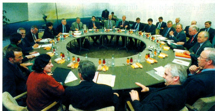
The round-table discussions contributed to the long-term reduction in government budget deficits.

While the positions in the left and right camps are clear, two factions have emerged in the centre parties: one on