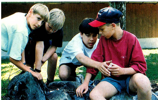
The summer camps in Switzerland for Swiss Abroad children and young people promise sports, games and fun.

In 1999 the Foundation for Young Swiss Abroad will once again be organising summer holiday camps in Switzerland for youngsters between the age of 7 and 14. If asked, the Foundation is prepared to consider a reduc-