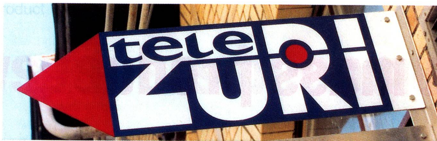
Private TV stations such as "teleZÜRICH" characterise the media scene.

mation for 50%, television for 40%, and SBC radio 20%. Half of foreign television programmes are used for entertainment, domestic channels only one third. A third of the population watch the «Tagesschau» of the SBC at 19.30.